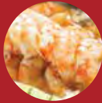
白灼鲜虾 Fresh White Shrimp