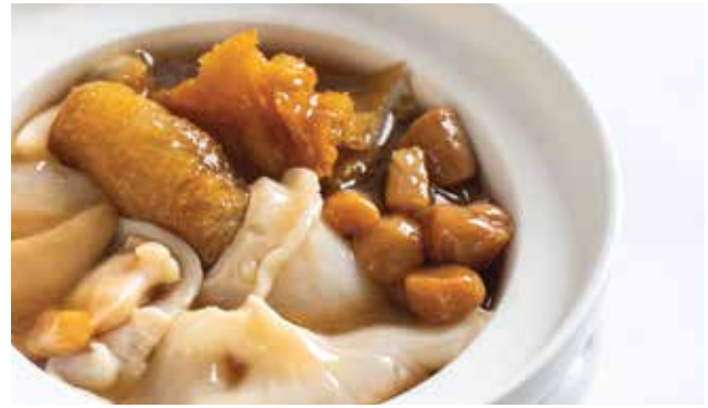
海味四宝 Four Treasure Soup