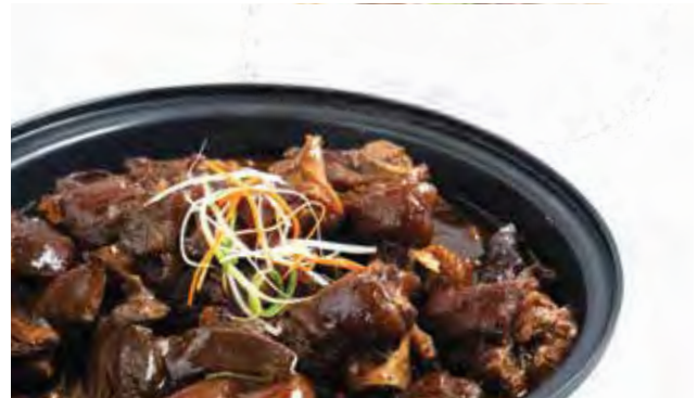
香焖猪脚猪肚 Braised Pork Trotters & Stomach