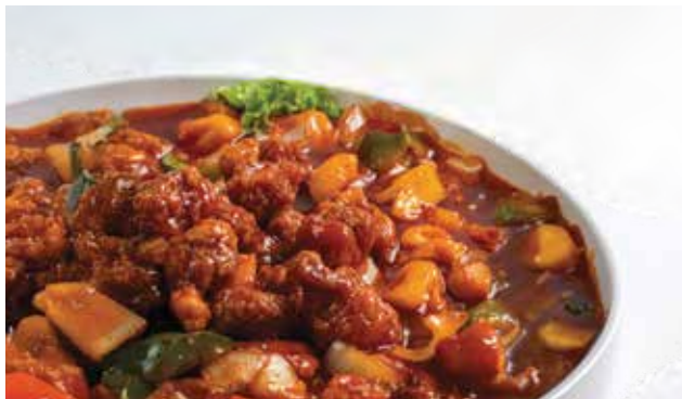
酸甜咕老肉 Sweet & Sour Pork

RM22 | RM42 | RM65 Small 小 | Medium 中 | Large 大