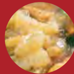
软糯牛筋 Soft & Tender Beef Tendon