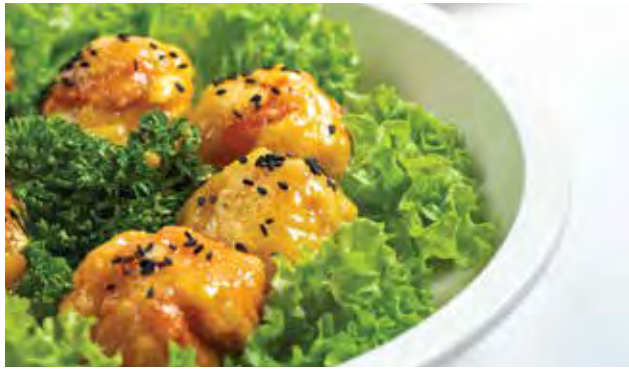
富贵大虾球 Golden Prawn Ball