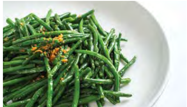
蒜米贵豆苗 Stir Fried Baby French Beans with Garlic / No Garlic

RM28 | RM50 | RM70 Small 小 | Medium 中 | Large 大