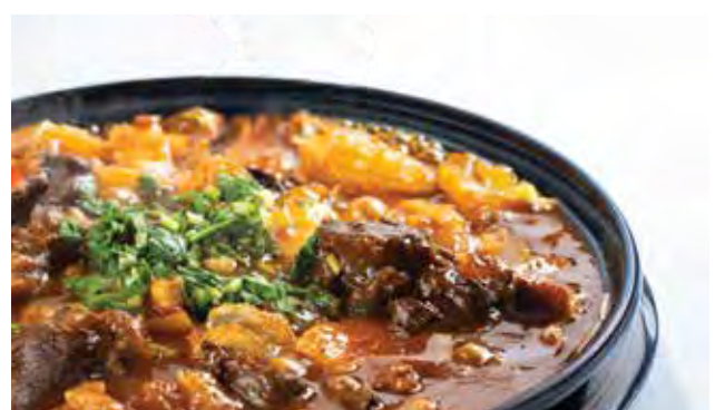
香焖牛肉金钱肚萝卜煲 Braised Beef & Golden Coin Tripe with White Radish

RM22 | RM42 | RM65 Small 小 | Medium 中 | Large 大