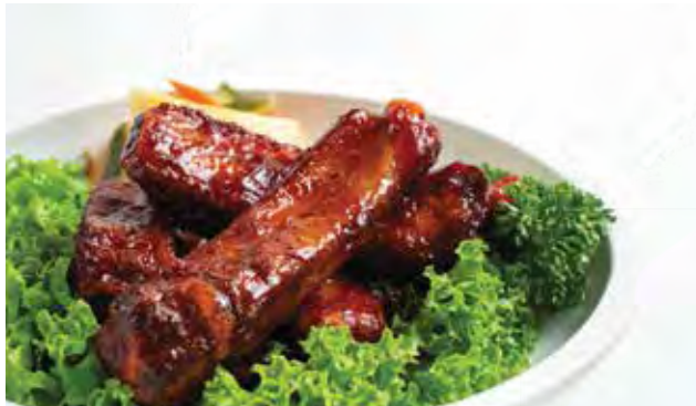
金猪一支骨 Golden Pork Rib in Pieces

RM28 | RM50 | RM70 Small 小 | Medium 中 | Large 大