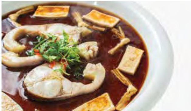
加帛野生白丁鱼 Kapit Wild Patin Fish